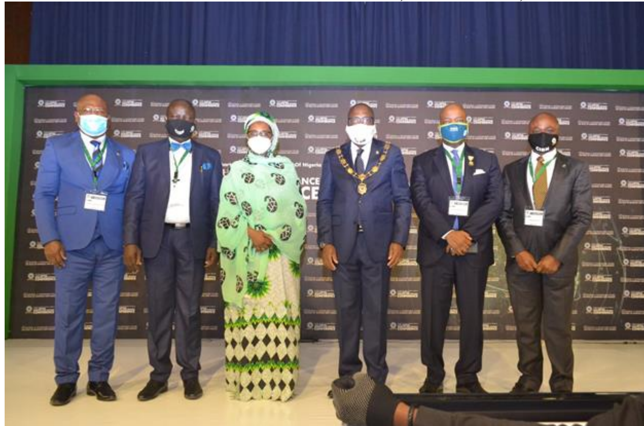
PHOTO NEWS FROM THE DAY 1 OF THE 13 TH ANNUAL BANKING AND FINANCE CONFERENCE WHICH HELD ON TUESDAY, SEPTEMBER 15, 2020.