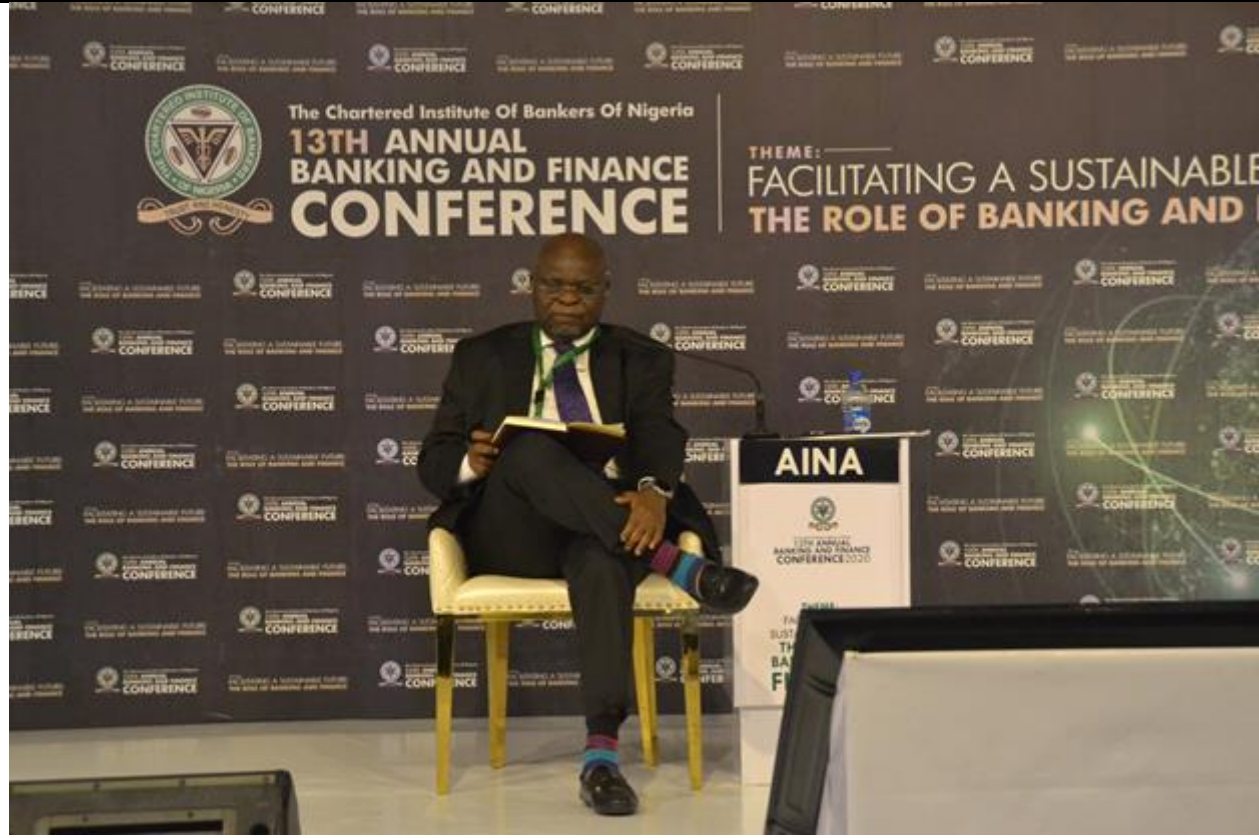
PHOTO NEWS FROM THE DAY 2 OF THE 13 TH ANNUAL BANKING AND FINANCE CONFERENCE WHICH HELD ON WEDNESDAY, SEPTEMBER 16, 2020.