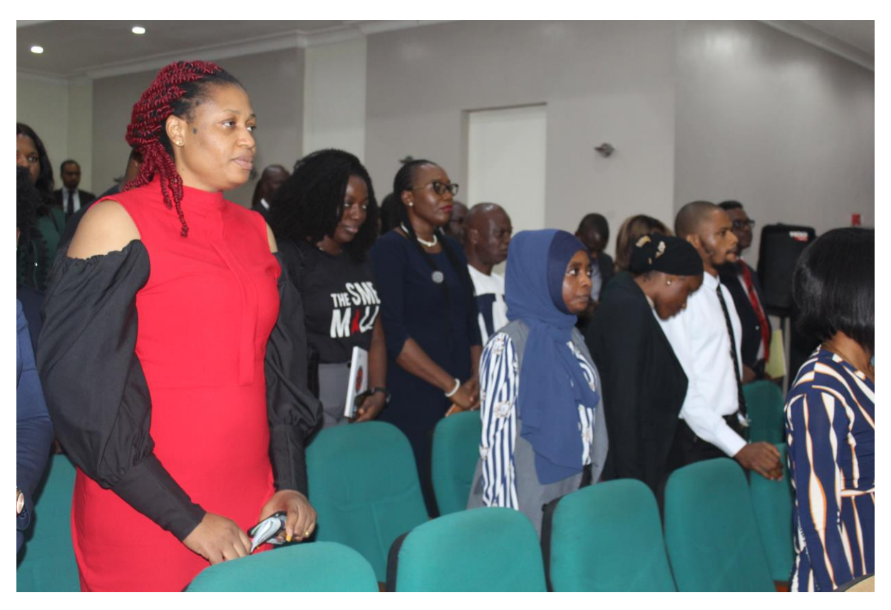
PHOTOS FROM THE "RESILENCE LEADERSHIP: STRATEGIES FOR ENHANCING CORPORATE PERFORMANCE" TRAINING WHICH HELD ON WEDNESDAY, DECEMBER 7, 2022 AT THE GEORGE HOTEL, LUGARD AVE, IKOYI, LAGOS